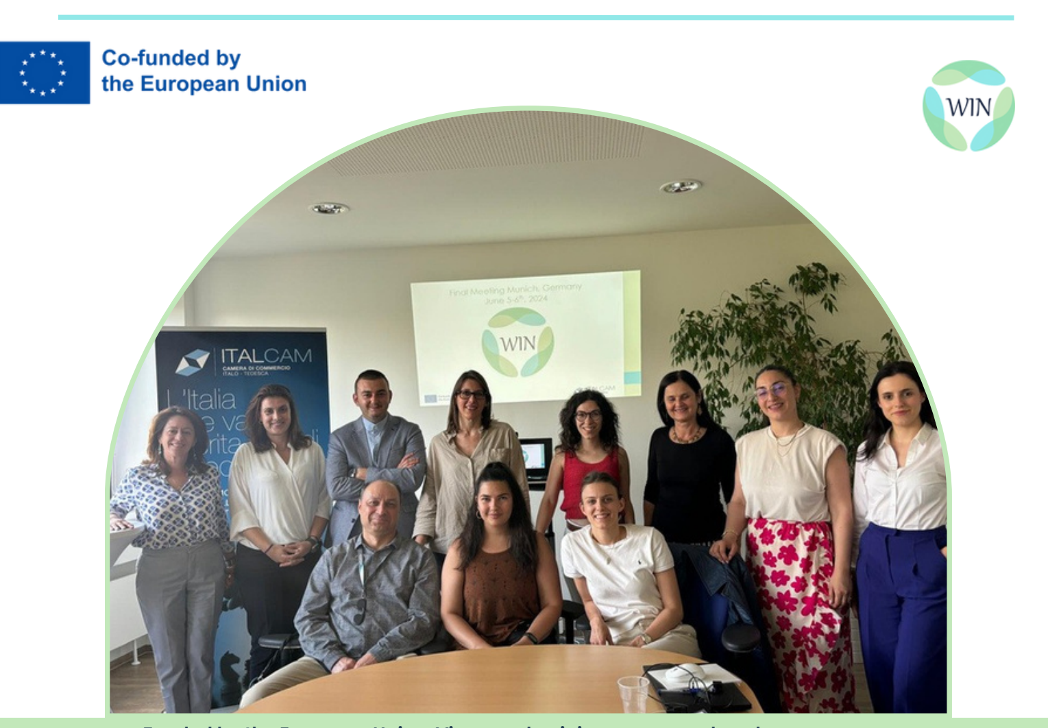
Funded by the European Union. Views and opinions expressed are however those of the author(s) only and do not necessarily reflect those of the European Union or the European Education and Culture Executive Agency (EACEA). Neither the European Union nor EACEA can be held responsible for them.

During our last meeting, we covered the final aspects of the project: Results of the Pilot Tests: We're delighted to report that the platform underwent thorough testing by 60 users. These tests assessed usability, content quality, and how well the platform meets the needs of Small and Medium-sized Enterprises (SMEs). The feedback from these tests was crucial in refining the platform. Handbook and Additional Materials: We've developed a user-friendly handbook and additional resources to support you as you navigate the platform. We're proud to announce that the platform has received positive feedback from our pilot users. It's designed to be user-friendly, allowing you to access modules, study at your own pace, and participate in the certification process. Platform Improvements: We discussed the feedback in detail to make further improvements that enhance the platform's functionality and user experience. Looking Ahead:We're committed to making continuous improvements based on the detailed feedback from our pilot testers. Let's make the most of our efforts together and keep moving forward!